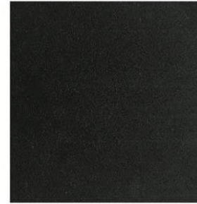
0204 Midnight Black